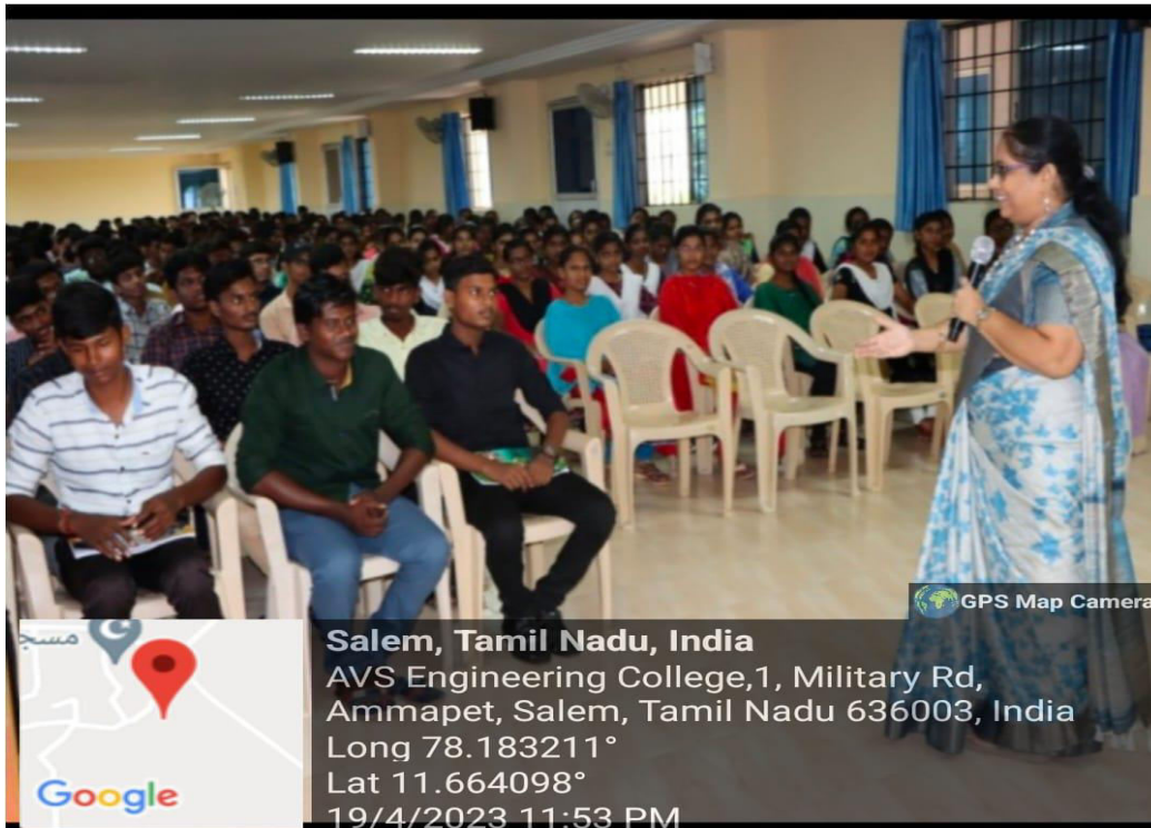
Seminar on “Exploring Opportunities in Academia and Industry”-19.04.2023