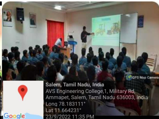
Seminar on "Scaling and Growth Strategies for Engineering Startups" -23.09.2022