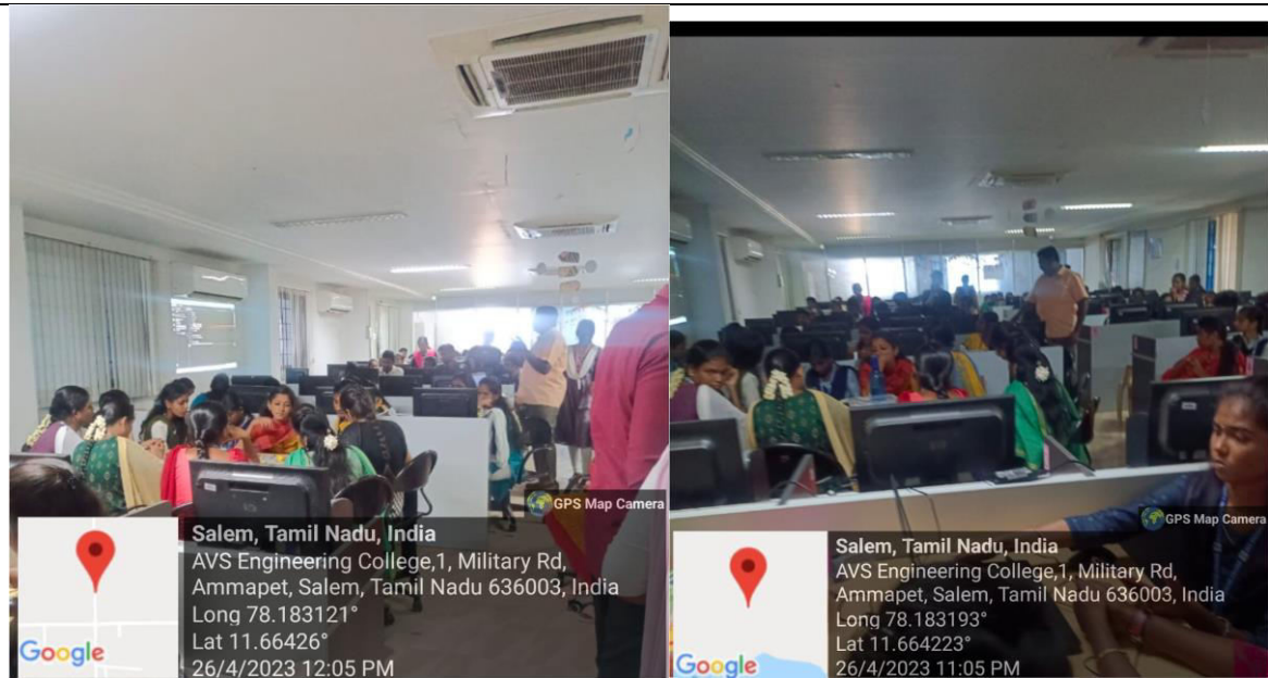
Seminar on “Engineering Entrepreneurial Mind-set and Resilience” on 26.04.2022