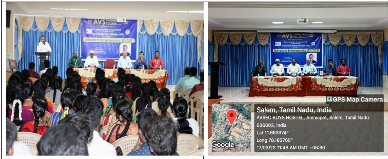
Seminar on “Innovation to Entrepreneurship (I2E 2023)” -17.03.2023